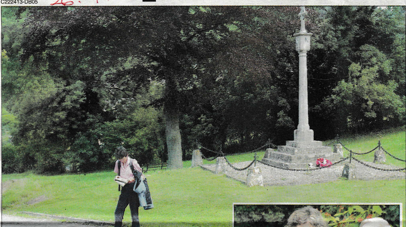
LANDMARK: A walker looks at her map by the village war memorial.