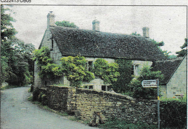
■ PICTURESQUE: The road to the Far End past Cotswold cottages.