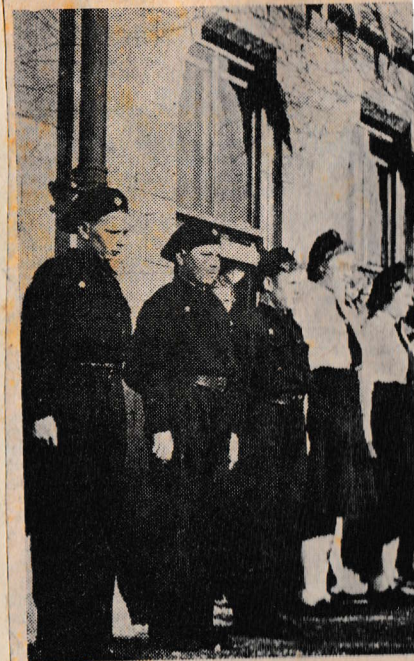
Junior Cadets of the British Red Cross Society.