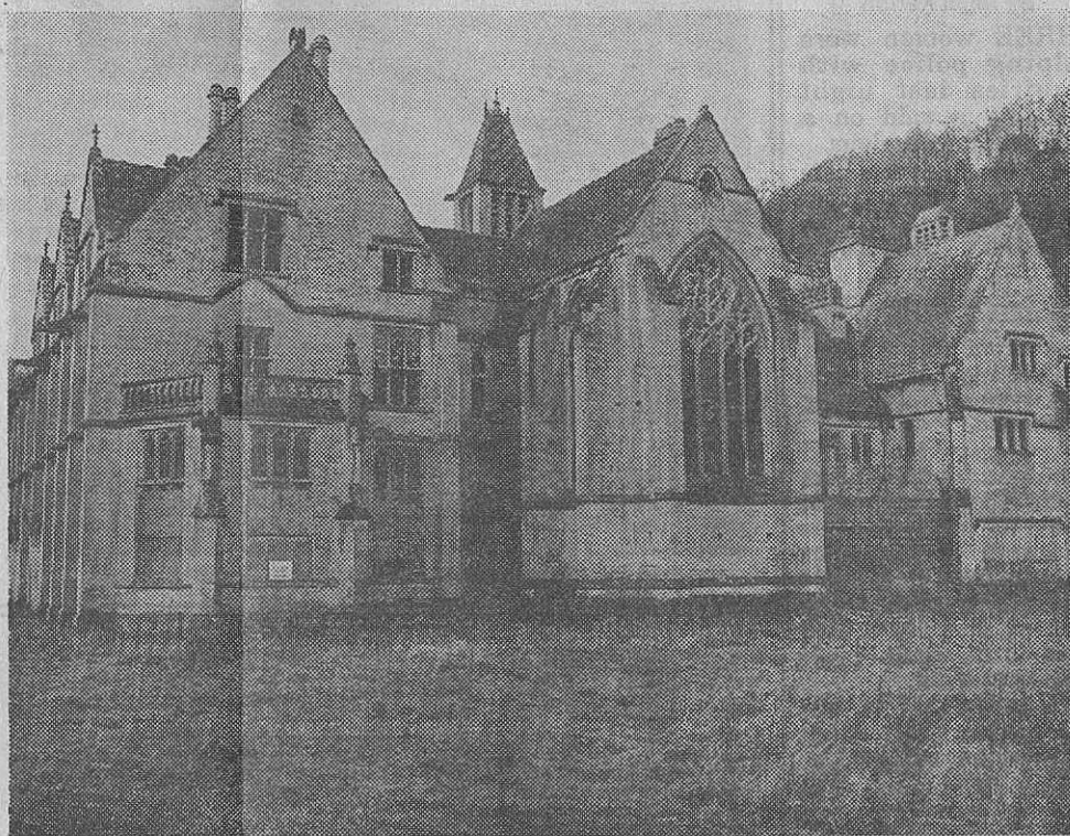
Abandoned . . . Woodchester Park