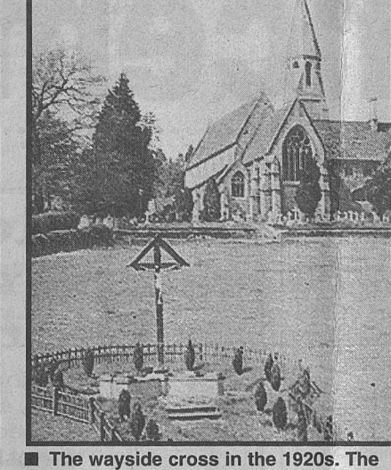
figure of Christ has since vanished. *