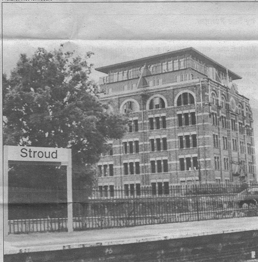
■ TOP FLOOR: An artist's impression of what the planned penthouse flats on top of the Hill Paul building would look like, as seen from Stroud railway station.