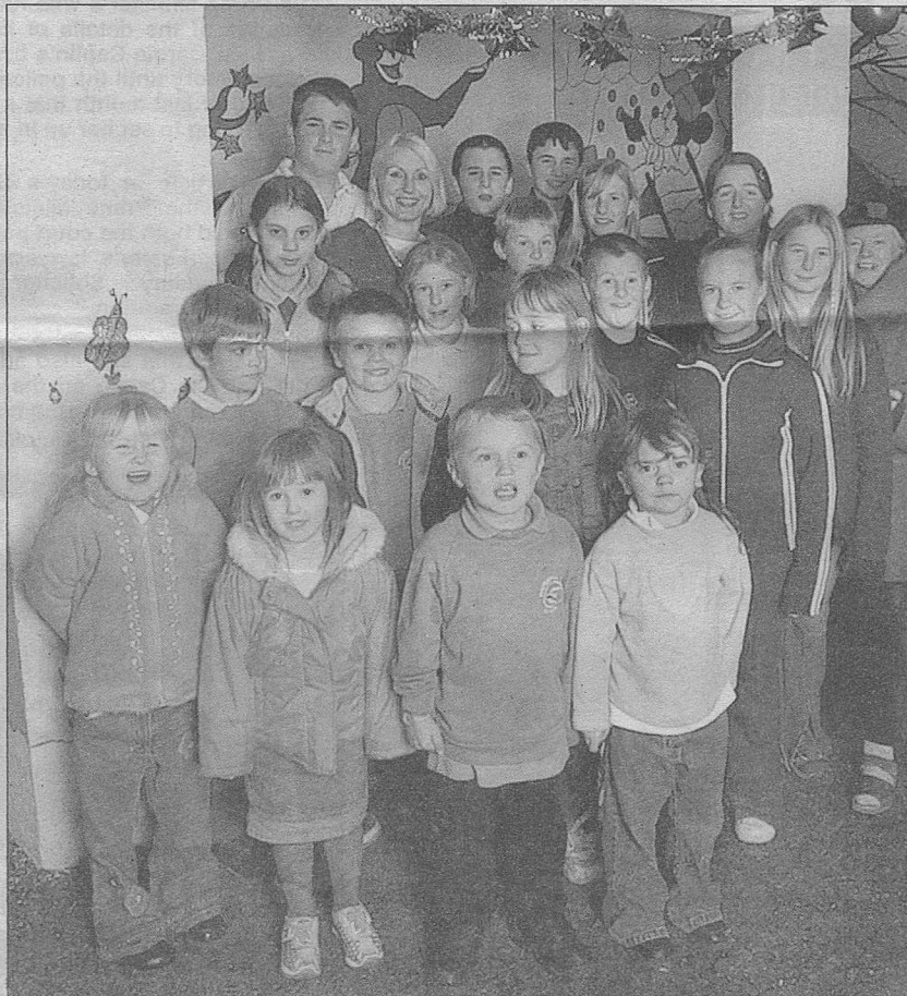
■ WINNING THEIR BATTLE: Some of the children who redecorated the bus shelter at Whiteshill after it was defaced by vandals.