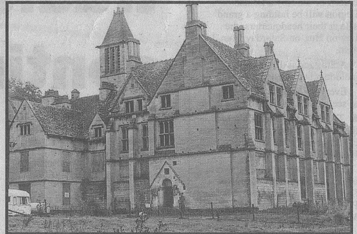
■ Woodchester Mansion – unfinished Victorian architectural masterpiece. ★