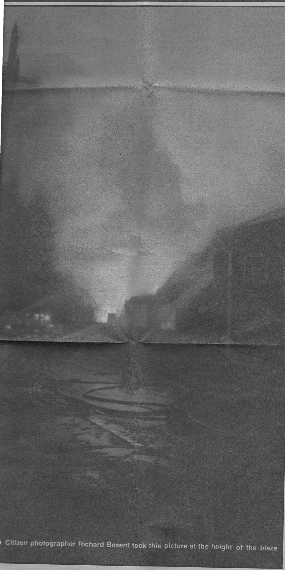
● Citizen photographer Richard Besent took this picture at the height of the blaze